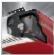
12V DC battery fits neatly inside the opener

The patented EverCharge® Standby Power System will operate the garage door opener for 40 cycles within a 24-hour period and power vital safety functions, such as The Protector System® safety reversing system, in the event of an electrical outage. Plus, when the power comes back on the system recharges automatically.